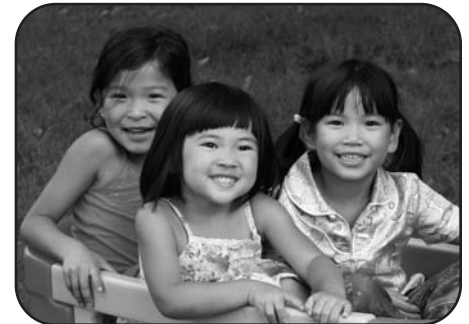
OCA/TRFCC 2007 Summer Picnic

For more information about the OCA, please visit www.ocapghpa.org !